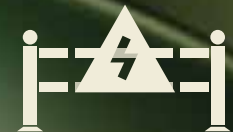
PERIMETER WALL WITH ELECTRIC FENCE