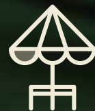
ACCESIBLE ROOFTOP TERRACES